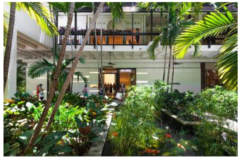
Bal Harbour Shops

It wasn't that long ago that internet sales were essentially limited to catalog order fulfillment and to a few online pioneers who saw an opportunity to sell directly to the consumer without requiring them to endure what for many had become an experience to be endured instead of one to be enjoyed.