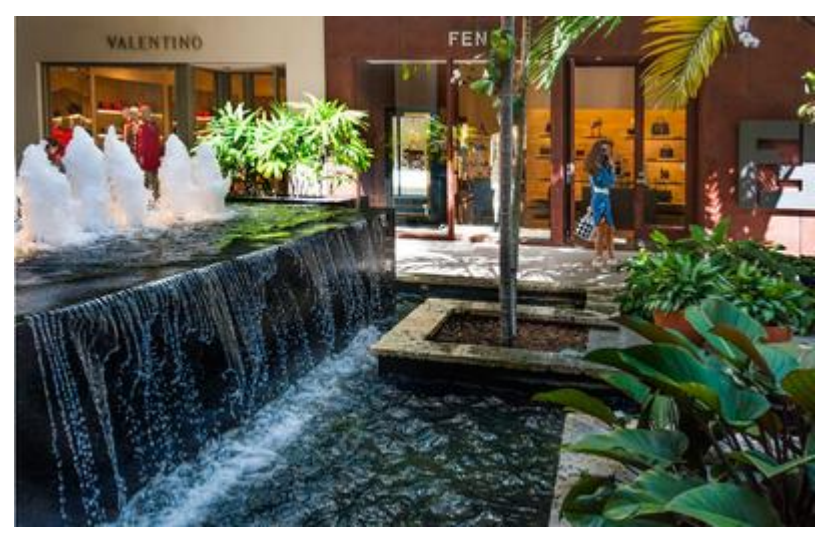
Bal Harbour Shops

The most successful shopping centers tend to be in popular tourist destination, the more affluent the better. The high-end retailers benefit enormously from the additional sales generated by global tourism.