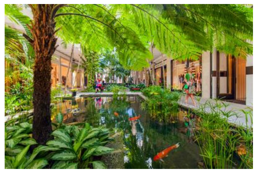
Bal Harbour Shops

Maintaining our heritage and being true to our DNA is the enduring value for the loyal clientele, as well as the magnet for new clients.