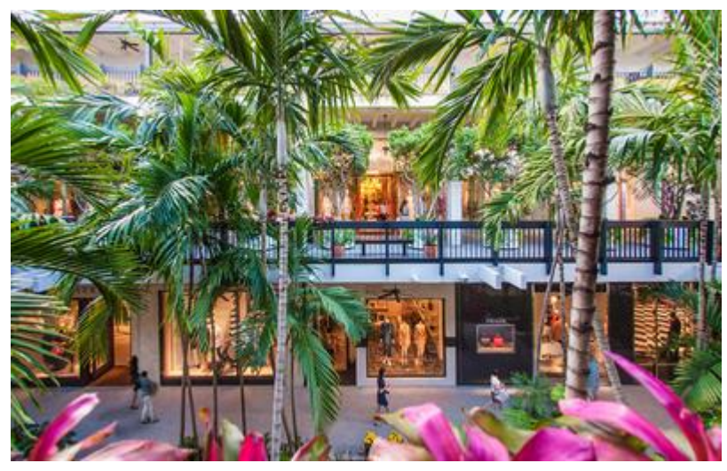
Bal Harbour Shops

While the stores themselves are collectively the ultimate draw, it's the finely manicured and intricately curated experience of Bal Harbour Shops that resonates.