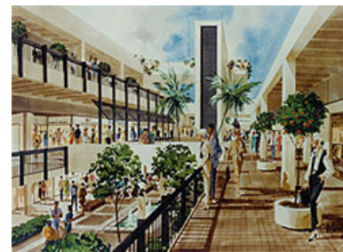
How the mid-century modern mall was envisioned 50 years ago