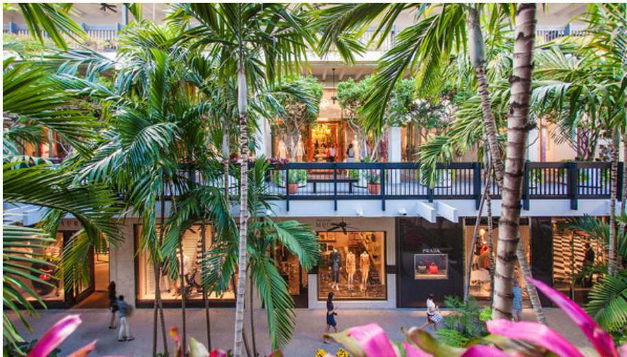
The walkways and luxury outlets of Bal Harbour Shops today

The chicest, most successful mall in America is celebrating its 50th year. But can retail group keep up with the new kid on the block?