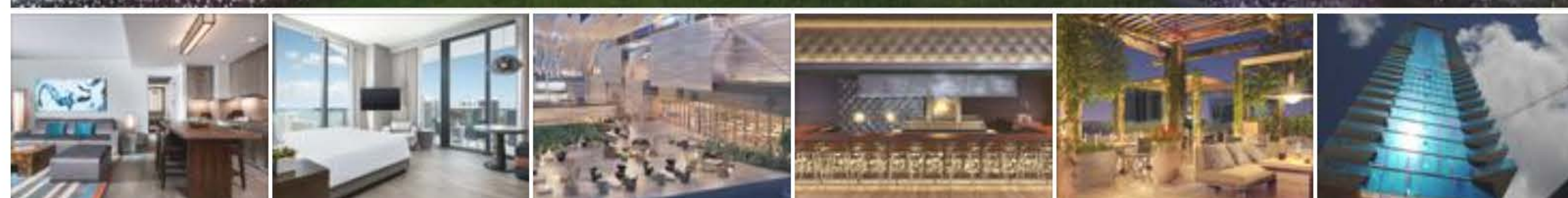
Brickell City Centre will occupy nine acres along South Miami Avenue between Sixth and Eighth Streets in downtown Miami.