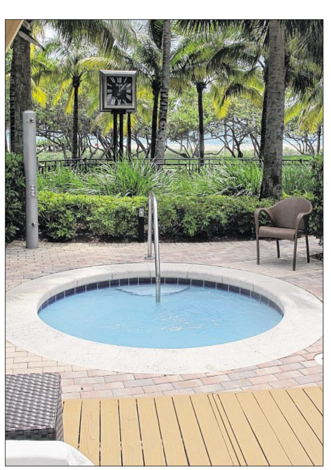
At the Ritz-Carlton Bal Harbour Miami, you can spend an entire day relaxing in a private poolside cabana.

is low season in Bal Harbour – we found its newly expanded beach practically private. Three of Bal Harbour's hotels are oceanfront properties, allowing you to traipse directly from your suite onto the beach where lounge chairs with umbrellas make for a postcard-perfect place to spend the day. Work off rich meals while taking in the views afforded along Bal Harbour's $3 million, one-mile, palm-shaded jogging and biking track and cool off in the waves