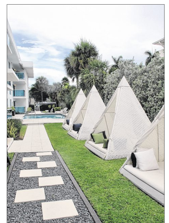
The cabana pyramids at Bal Harbour Quarzo provide the perfect poolside place to relax.