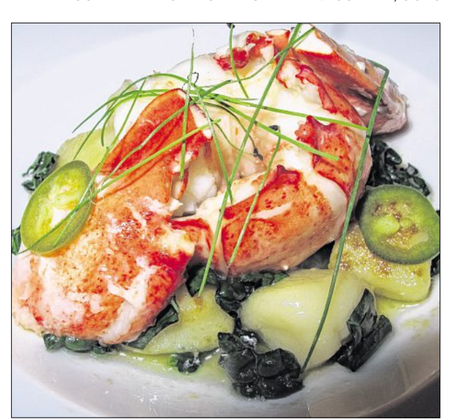
Order a savory Maine lobster dish at St. Regis Bal Harbour's J&G Grill.