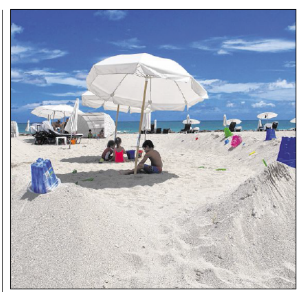
Children play in the sand during a beautiful fall day in Bal Harbour.